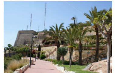
San Fernando Castle, Alicante

I prefer reaching the castle by foot, passing by a picturesque suburb Barrio de Santa Cruz (Holy Cross) . This suburb is full with small old houses painted in white and narrow streets full of flowers. There are also two important sacral monuments: chapel of Santa Cruz and St Rocco. Arriving to the slopes of the mount, you enter Park Ereta that gradually climbs up to the fort. At the park entrance you will find Alicante Water Museum. Climbing up its terraced walkway, you can enjoy stunning views over the city and its harbor. In sunny days you can also easily see a tiny island of Tabarca on the south, in front of the coastal town of Santa Pola.