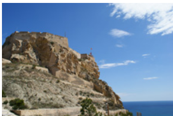
Castle of Santa Barbara, Alicante

Along Explanada, there are several rows of palm trees separating its pathways and forming a good shade. Its numerous restaurants and pizzerias are ideal places to have dinner. During daytime, you can refresh yourself taking a juice or an ice cream, or perhaps having a fast snack in Subway, McDonald's and in Turkish or Chinese restaurants. You can also entertain yourself watching the